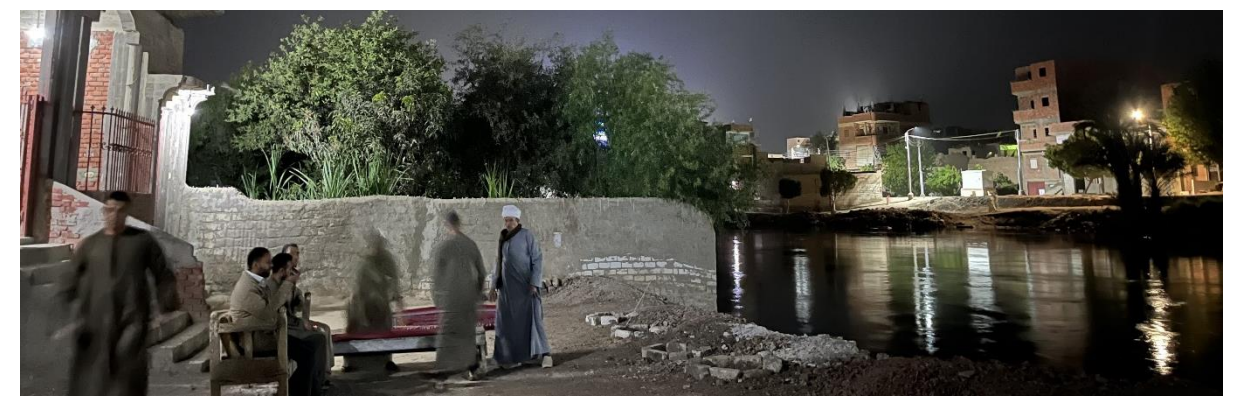
This photo was taken by Ali Zaraay and Farah Hallabeh in Delga village, Menya governorate, Upper Egypt, featuring Egyptian returnee men from Jordan.