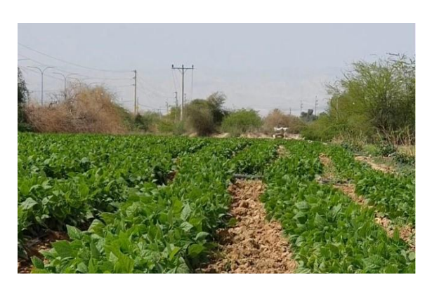
Farms in Jordan Valley.

This research found that farmers in Jordan prefer to hire Egyptians due to their willingness to perform physically demanding duties and work very long hours, as well as the fact that they can be paid late. Few Jordanians engage in this industry. In all sectors of employment, 13 working hours per day are common, with Egyptians appearing to be one of the most overworked groups in Jordan (Tamkeen, 2014). The average workload adds up to 6.26 days per week and 9.49 hours per day (Abdelfattah, 2019).