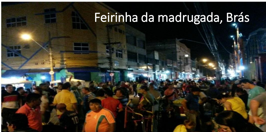
Feirinha da madrugada, Brás