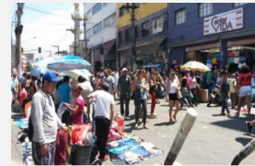
The street vendor self-entrepreneur