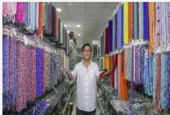
The cross-border migrant entrepreneur