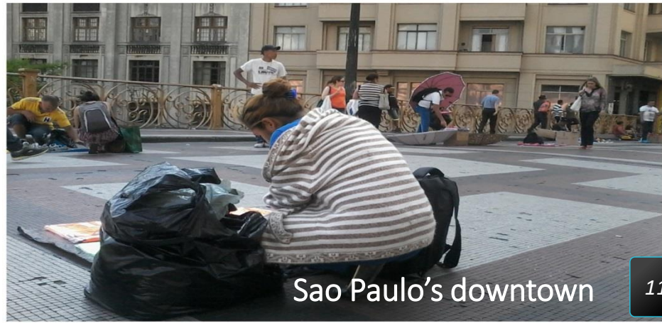
Sao Paulo's downtown