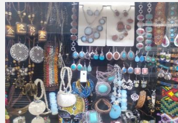
The proletarian of the handcraft workshop